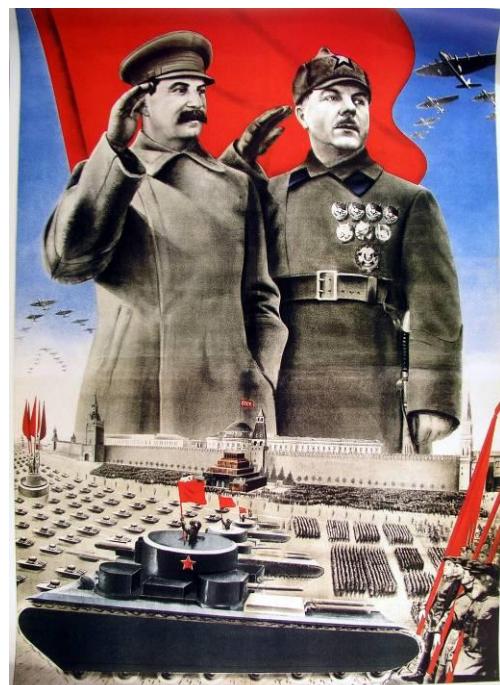
"Long live the worker-peasant's red army – the faithful guard of the Soviet borders!"